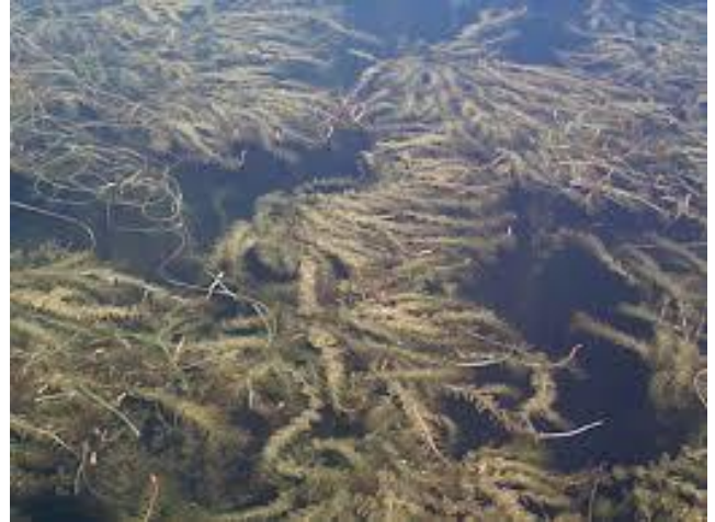
Invasive Eurasian Watermilfoil

Residents of Lake Sir John are very concerned about protecting the lake's environment from invasive and dangerous species. If you encounter a suspicious boat with no decal, you can explain to the outsider that this is a private lake with no public access; people using watercraft without a decal or guests of a resident should be asked to remove their boat in order to protect the lake from outside invasive or dangerous species. Make note of any identifying information and notify the president of SIJOLM.