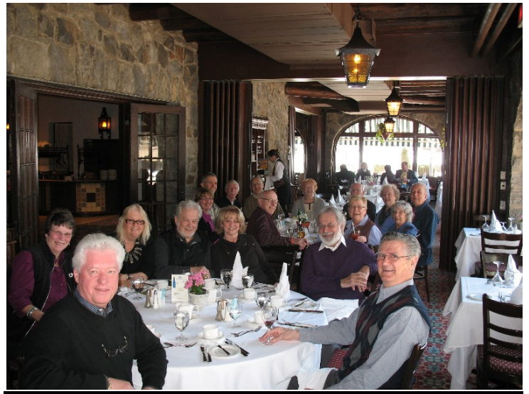
Lake Sir John Luncheon, Montebello 26 March 2011